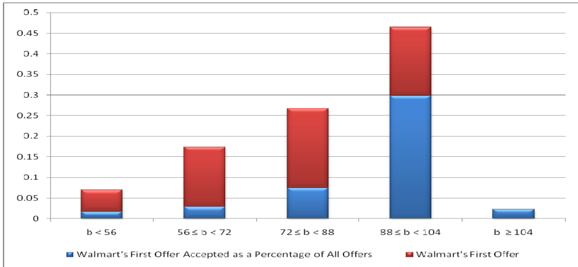
Figure 2: Empirical Distribution of Walmart's First Offers and Distribution of Walmart's First offer Acceptance